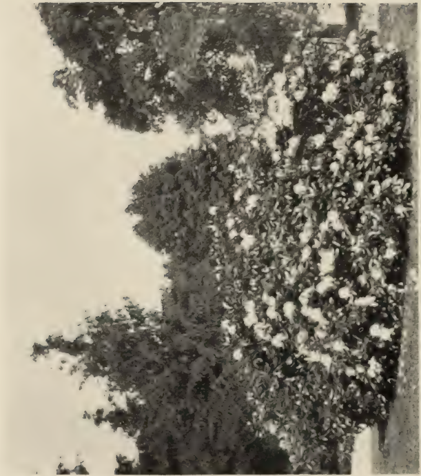
FINE SPECIMENS OF RHODODENDRON HYBRIDUM.